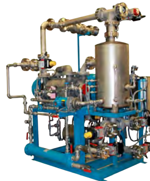
Custom Solutions to 12,000 CFM