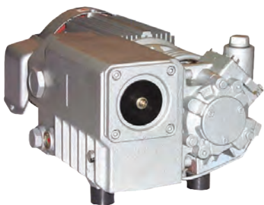
Single-Stage Oil-Sealed Rotary Vane