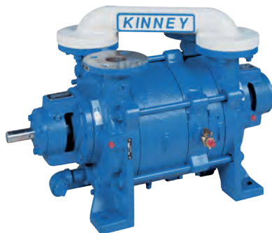
Two-Stage Liquid Ring