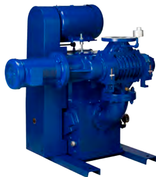
Liquid Ring & Booster/Piston