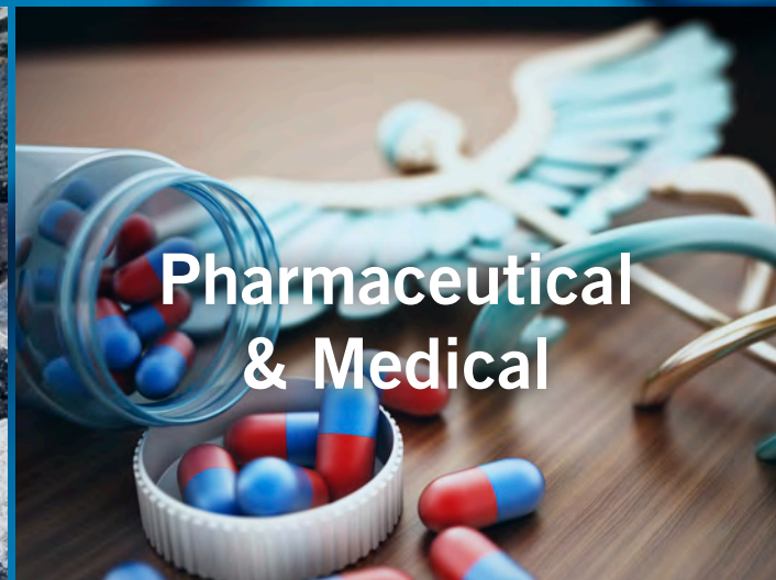
Pharmaceutical & Medical