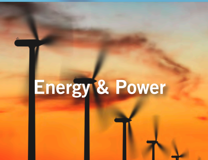
Energy & Power