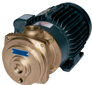
Single-Stage Liquid Ring