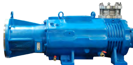
Variable Pitch, Dry Screw